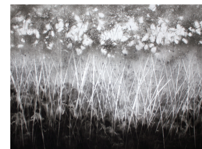
Landscape, charcoal