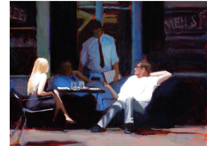
We'll Have Another Round , oil on panel ©2025 Dan Graziano