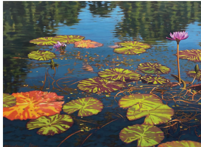
Waterlilies at Brookgreen, oil on panel