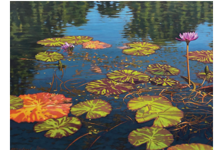
Waterlilies at Brookgreen, oil on panel

Visit hsvmuseum.org under Learn – Master Artist Workshops for more information and to register!