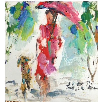
Happy Girl, Happy Dog , oil on canvas ©2024 Linda Ellen Price